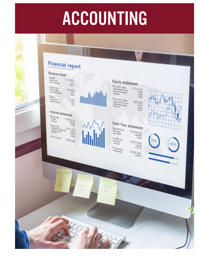
Accounting & Finance Earn Your Associate Degree or Certificate from RichmondCC!